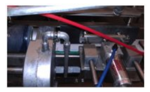
Figure 2: Processing machinery

Another common but extreme hard-to-reach area includes any cracks and crevices within a facility. Although crevices are to be avoided within production facilities (and should be repaired if found), it is impossible to guarantee that there are no cracks or crevices within the production area at all. Liquid disinfectants and sterilant methods deal with surface tension, which prevents them from reaching deep into cracks. Vapor, mist and fog particles tend to clump together due to strong hydrogen bonding between molecules, which often leave them too large to fit into crevices. Figure 1 shows bacteria found in a scratch in a stainless steel surface after it had been wiped down with a liquid sterilant. The liquid sterilant was unable to reach into the scratch and kill/remove the bacteria. The bacteria were protected by the crevice created by the scratch, giving them a safe harbor location where they could replicate and potentially exit in the future to contaminate product itself.